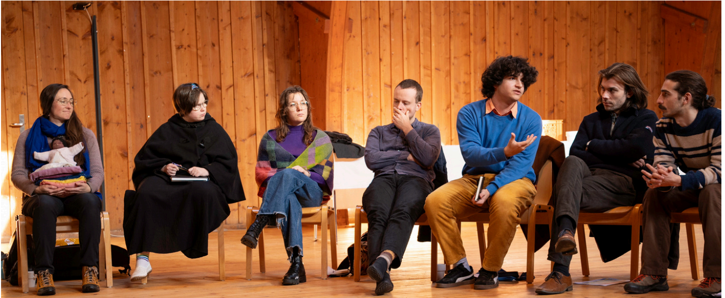
Presenting initiatives during the Coworker's Gathering - Dornach, January 2026

In January '26, 30 coworkers from 18 youth groups came together in Dornach for an annual gathering to strengthen and determine the global tasks we carry together. In addition to art, intercultural exchange, and study of Rudolf Steiner's presentation of sources of spiritual inspiration and how they are connected and the virtues of freedom, equality and fraternity, the gathering was a chance for coworkers to create and reassess existing working groups, which emerged during previous Gatherings, which support and facilitate ongoing worldwide tasks.