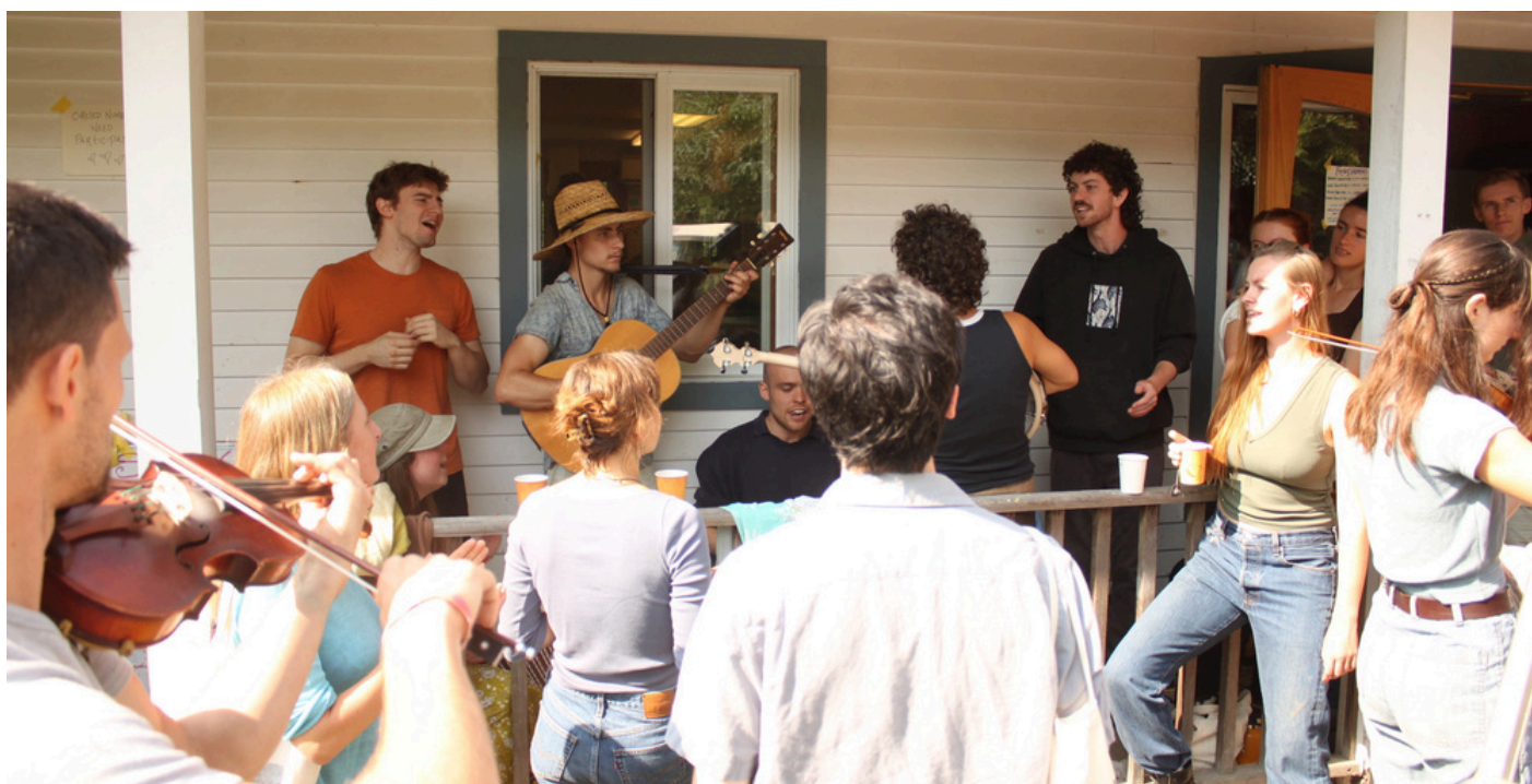
Music jam during The Light Between conference - New York, USA, August 2025

The Section's work is happening in a de-centralized, free association of youth groups and initiatives around the world, taking on a variety of forms. For instance, 2025 saw youth conferences, such as The Light Between in Upstate New York, USA – the biggest youth conference in North America this century, and The Gifts of Africa in Tanzania – the first youth conference of the inter-African group, Youth Initiative Africa . There is also fulltime youth programs, such as the Jugendseminar in Germany and the International Youth Initiative Program (YIP) in Sweden.