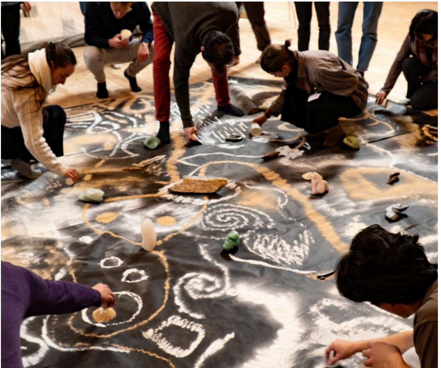
Creating a Community Art Work - Dornach, February 2025

Along with carrying and supporting these various working groups of the Section, the Youth Section Team at the Goetheanum also creates youth events, conferences and projects, that can speak to the transnational and global tasks of the Section. In 2025 these included: