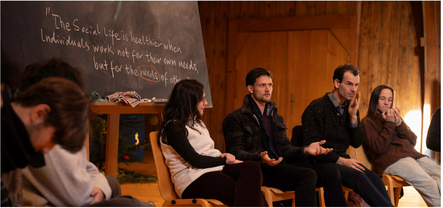
Conversation about our work during the Coworker's Gathering - Dornach, January 2026

4. The Youth Education Association is a working group comprised of individuals who are leading anthroposophical programs, projects and courses for young adults from Thoreau College in the USA, Ruskin Mill in the UK, Leiden University in the Netherlands and the Youth Seminar in Germany. The seed for this association was sown at the Youth Education gathering in the Netherlands in 2024, organised in collaboration with the Iona Foundation . Over the past half a year, during 2025, these individuals met regularly to learn about their youth initiatives and to share from the pedagogical approaches. They have set the goal of an in person gathering for educators and youth workers in 2026, with the intention of annual or biannual events and publications to follow.