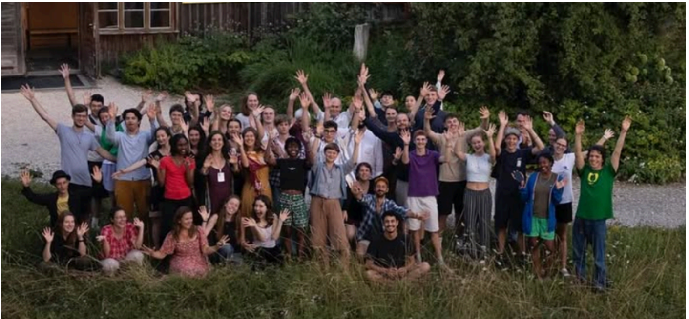
Structures for Freedom - Dornach, July 2025

Structures for Freedom is an international effort to host open conversations about the meaning of education with young people, and which involved a gathering at the Goetheanum in July 2025. Structures for Freedom is carried by a core team comprising of members from Germany, Switzerland, Argentina, and the Netherlands, who have created conversation materials and exercises implemented during the July gathering, as well as smaller events and workshops at youth events and schools around the world. The heart of this project has been to encourage open, simple conversations between young people about education and its greater meaning. It is carried by a conviction that, asked in the right way, there is a great source of wisdom young people can bring to bear on questions of education. The next phase of the project will culminate with a presentation of these ideas at the International Student's Conference in April, 2026.