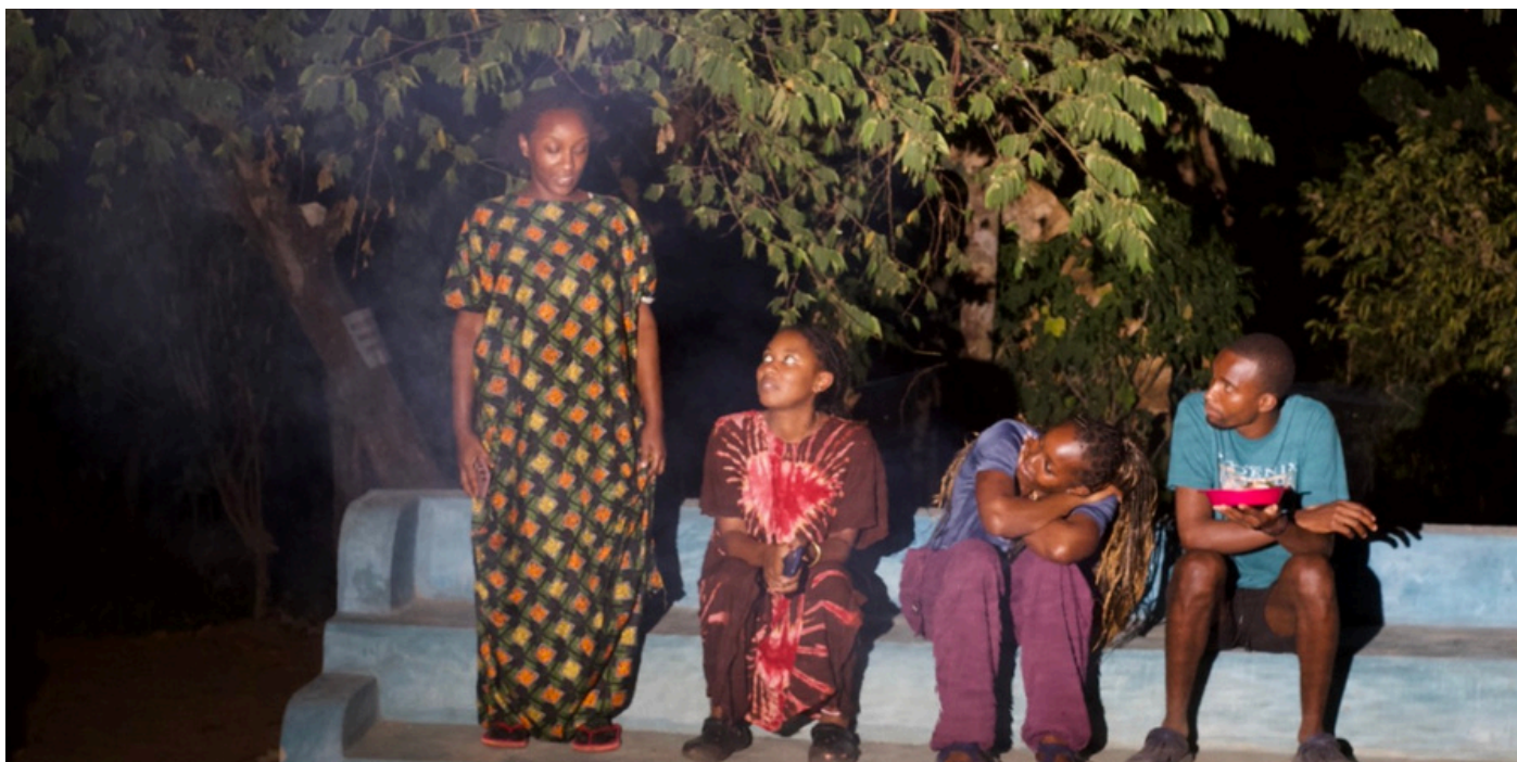
The Gifts of Africa Conference - Tanzania, September 2025

The Section's work is happening in a de-centralized, free association of youth groups and initiatives around the world, taking on a variety of forms. For instance, 2025 saw youth conferences, such as The Light Between in Upstate New York, USA – the biggest youth conference in North America this century, and The Gifts of Africa in Tanzania – the first youth conference of the inter-African group, Youth Initiative Africa . There is also fulltime youth programs, such as the Jugendseminar in Germany and the International Youth Initiative Program (YIP) in Sweden.