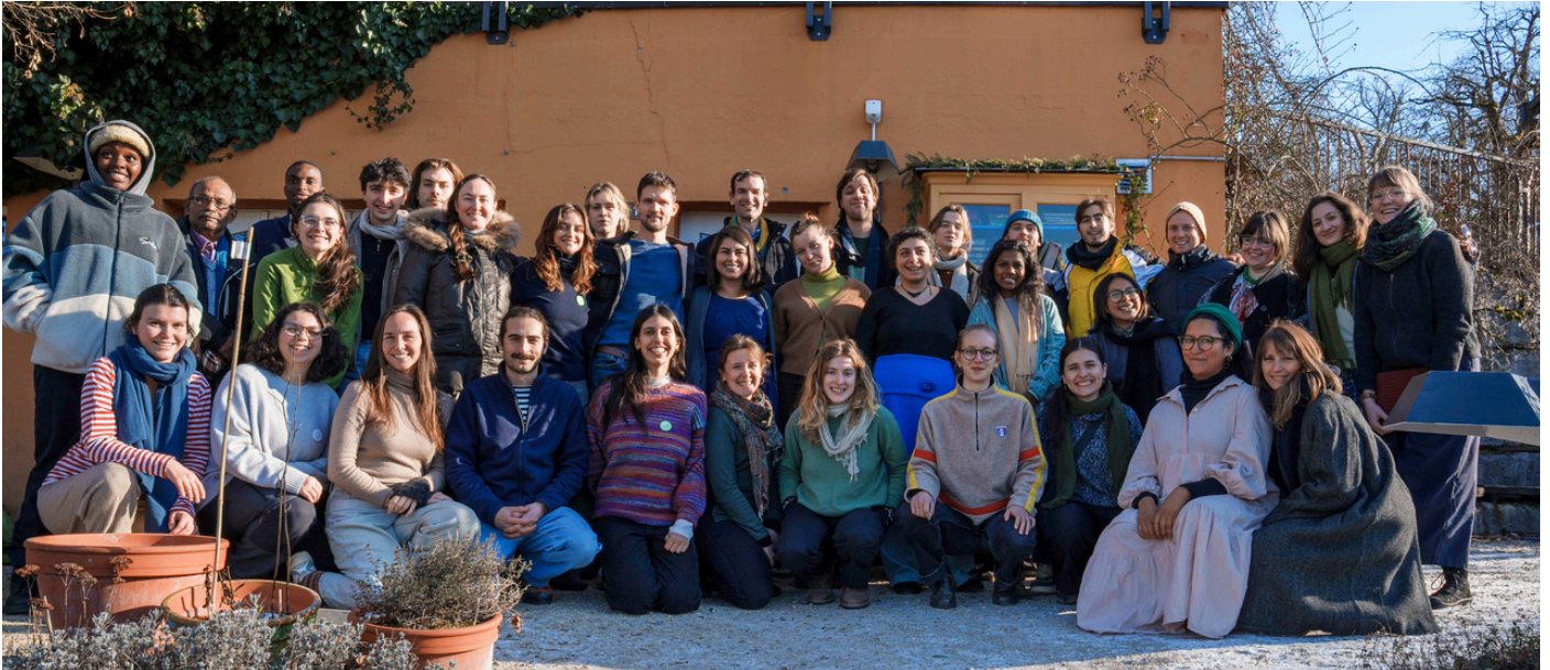
The Worldwide Youth Section Team during the Coworker's Gathering - Dornach, January 2026

"The attitude I hope to see prevail among young people is tolerance – allowing each individual to do what he or she can, without saying "Young people should not do this" or "The youth movement shouldn't be like that" We need to bring together as many people as possible, and people should act out of their own individualities to do whatever they can." Rudolf Steiner, 1924