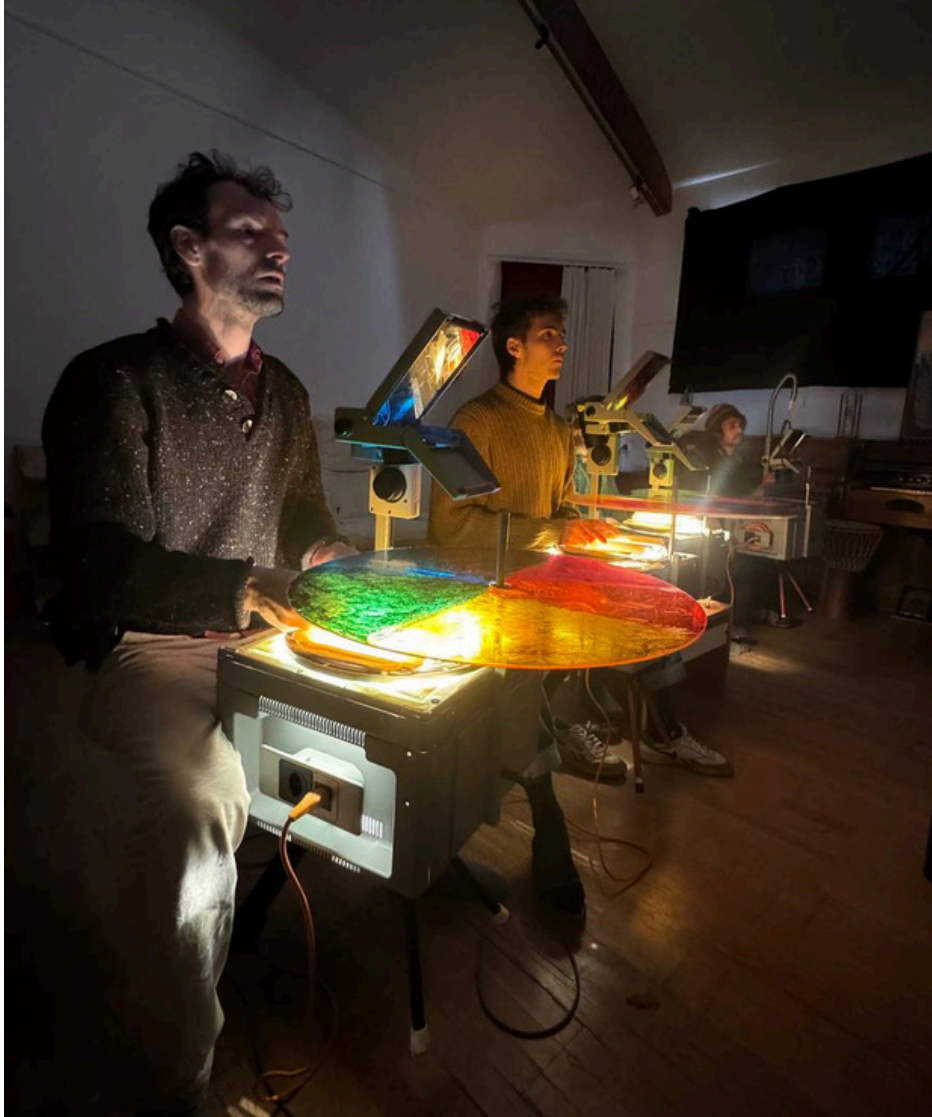
Rehearsal for the New Pegasus Project - Dornach, fall 2025

The New Pegasus Project , which arose from an impulse to find active ways to engage with screens and to start conversation around the presence of screens and media in our modern world. It involves an ensemble of eight young artists: four singers and four light artists, who have been learning to play a new suite of projection instruments for live screen performances.