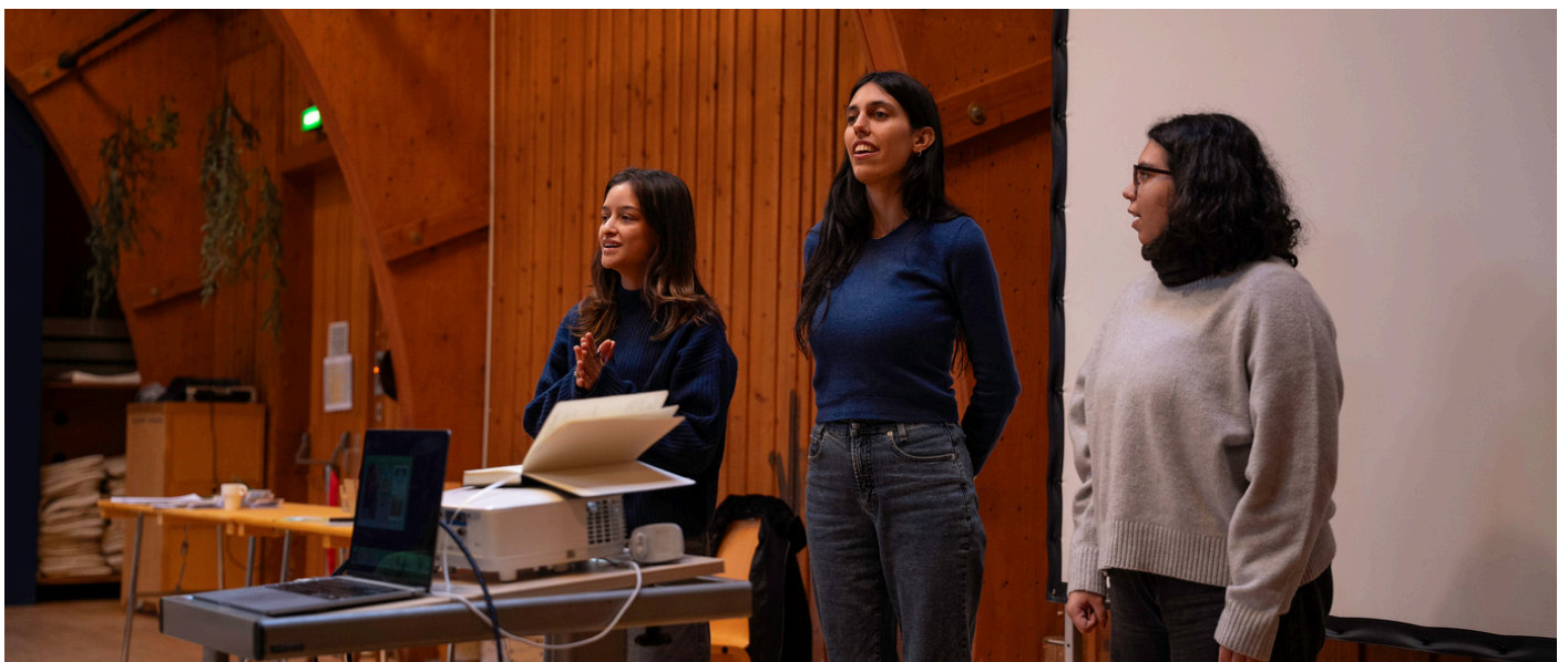
Presenting the Youth Education Association during the Coworker's Gathering - Dornach, January 2026

5. A new Coworker's Gathering planning team has formed with coworkers from the Netherlands, Italy, the US, Brazil, and Mexico to begin planning the next Gathering- to be held in Georgia or Brazil in the next year or two.