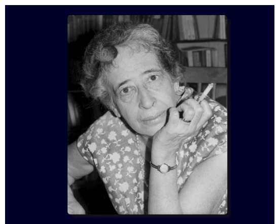
Hannah Arendt und Rudolf Steiner Zum 50. Todestag Hannah Arendts