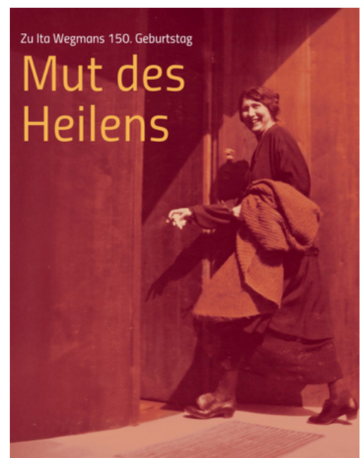
Book presentation and poster for "Courage of Healing" in 2026

Book publications planned for 2026 by the General Anthroposophical Section and the Ita Wegman Institute include works on Rudolf Steiner's scientific conceptions in the 20th and 21st centuries (for the Goetheanum leadership), on Ita Wegman and the future of the School, and on Albert Schweitzer and Rudolf Steiner. Further plans include the publication of a