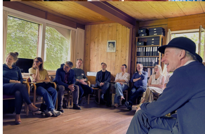
Alma Humana! 2025 and meeting for publishers, librarians and archivists