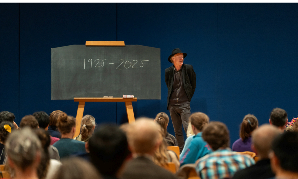
Student Day lecture and poster of the General Anthroposophical Section