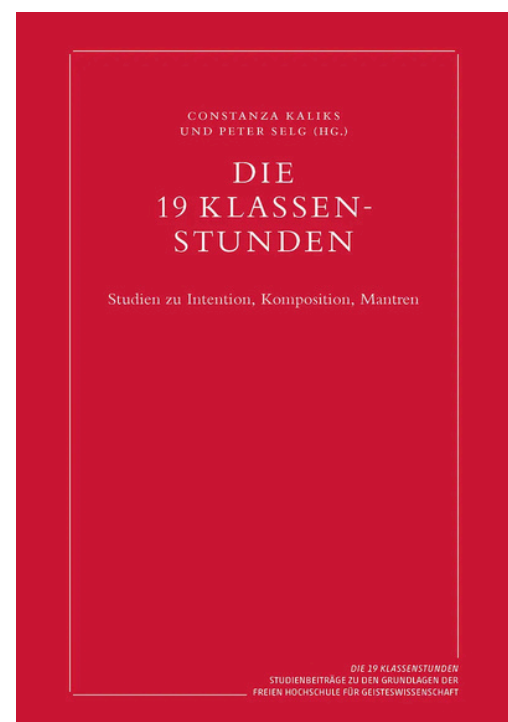
School Conference 2025 and publication on the First Class