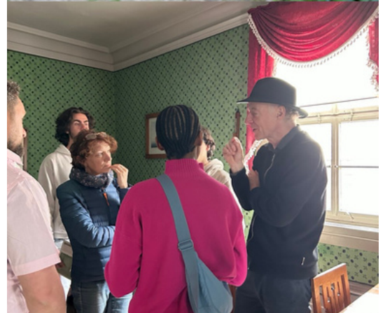
Students, performance of Goethe's Fairy Tale, at Schiller's House in Weimar | Event on Hannah Arendt and Rudolf Steiner