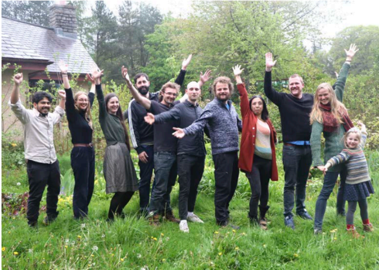
Some of the participants from this year's Youth Conference at Newton Dee.